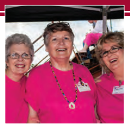
PCSH Supporting One Another

The RDLC truly cares about the success of each and every diabetes patient. Please call 870-508-1765 for more info