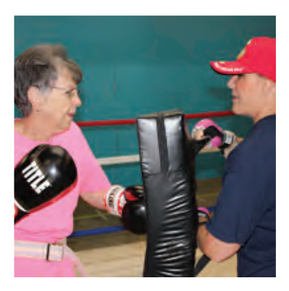
MFECOA Rock Steady Boxing