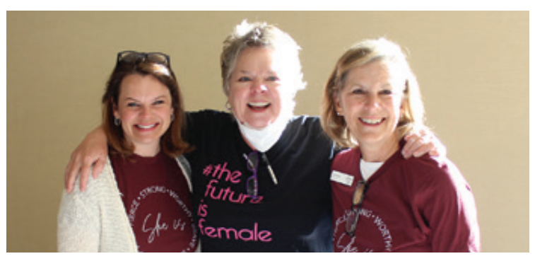
Teen Girls Go To College