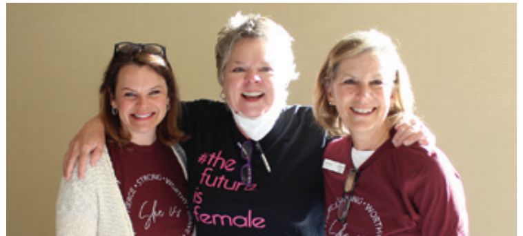
Teen Girls Go To College

The Schliemann Center for Women's Health is a vital part of Baxter Health's effort to provide excellent healthcare education for all women, whatever her age or role in life. We are here to support all women in becoming confident and educated in the areas of their health and assist them in making positive changes toward wellness. Call (870) 508-2345.