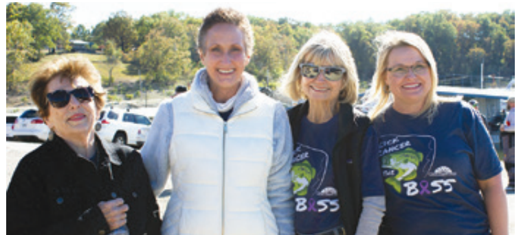
Kick Cancer in the Bass

The Peitz Cancer Support House is dedicated to helping anyone going through the cancer journey. You will find personalized support and group gatherings, information regarding diagnosis, treatment and survivorship. We provide care packages, wigs, hats, scarfs and mastectomy supplies. We're here to provide you with love, encouragement and hope - and make sure no one faces cancer alone. Call (870) 508-CARE (2273).