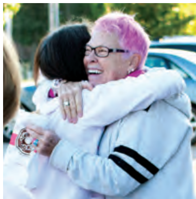
PCSH Supporting One Another