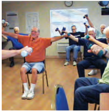
MFECO Fitness for Men Support Group

The PCSH is dedicated to doing everything they can to help those who have had cancer enter their lives. All services are provided free of charge. For more info, please call 870-508-CARE (2273).