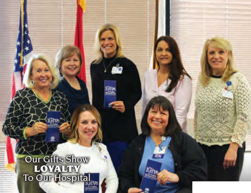
Our Gifts Show LOYALTY To Our Hospital