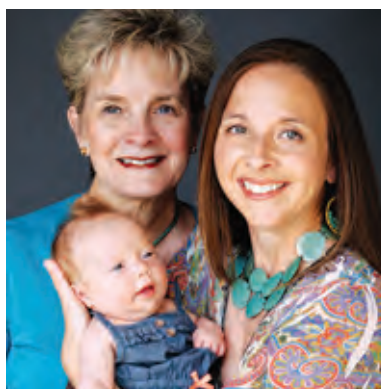
SCWHE - Supporting Women of All Ages