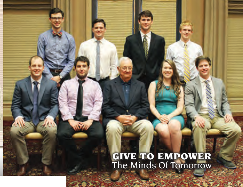
GIVE TO EMPOWER The Minds Of Tomorrow