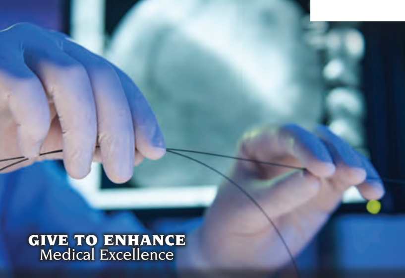
GIVE TO ENHANCE Medical Excellence