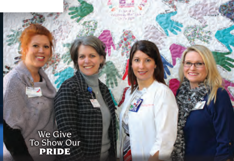
We Give To Show Our PRIDE