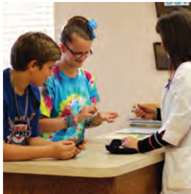
RDLC Teaches Blood Glucose Testing